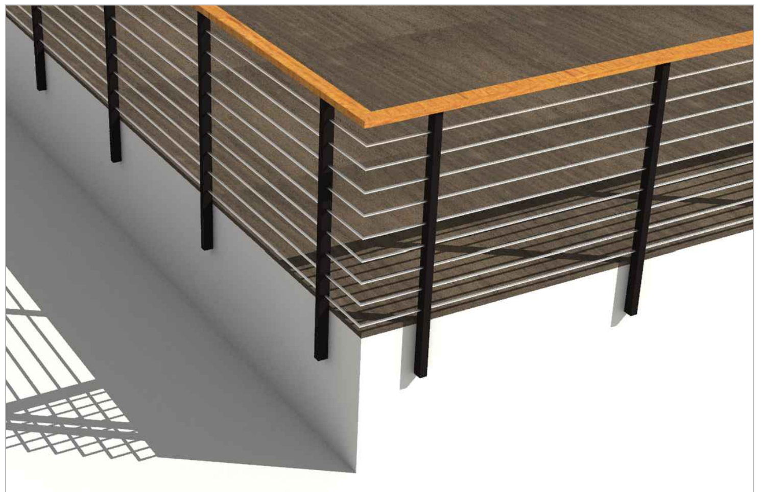
4 RENDERED PERSPECTIVE NTS